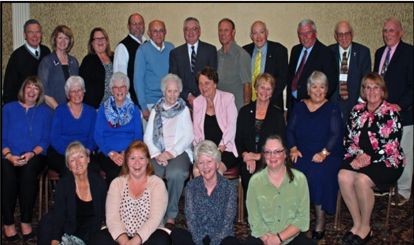
THE FULLER SOCIETY ANNUAL MEETING WILLIAMSBURG, VA OCTOBER 2015